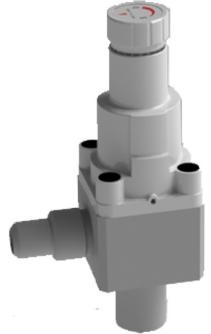
MPV 2-Way Sampling Valve