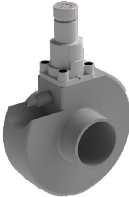
MPV Inline Sampling Valve